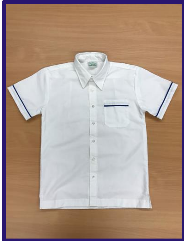
Boys white formal shirt Available in sizes 10-12, XS-XXL

The formal uniform is encouraged to be worn by students for whole school parades (Mondays), when participating in excursions and for very important occasions at school e.g. Awards ceremony. All school leaders are expected to wear the formal uniform on whole school parade days