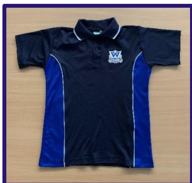
Navy with royal blue panel & School Logo