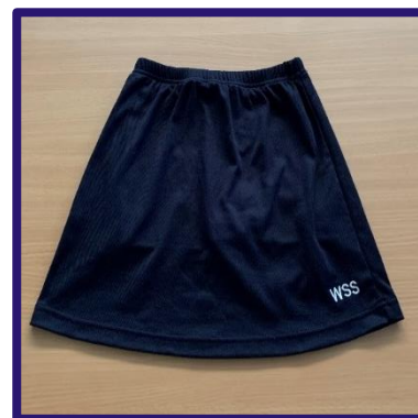
Navy skort with pocket ( built in tights )