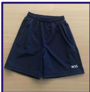
Navy short with pockets ( right side zip )