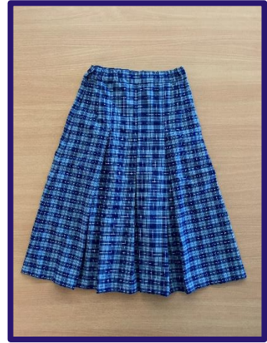
Girls formal skirt Available in sizes 8-12, XS-XXL