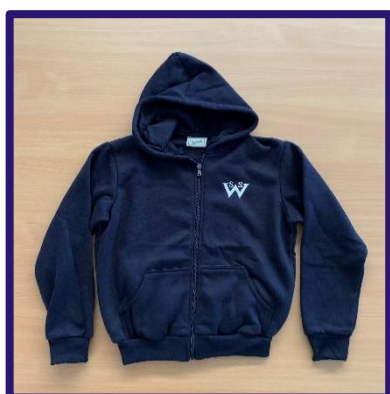
Navy hoodie or zip hoodie with pockets