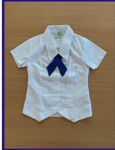
Girls white formal shirt with royal blue tie Available in sizes 8-12, XS-XXL